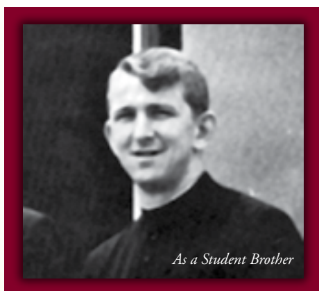
As a Student Brother