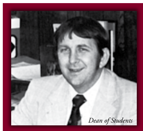
Dean of Students